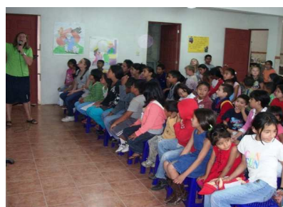
Kids Bible Club