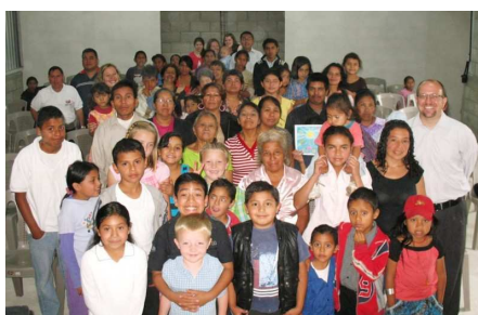
Easter in Ciudad Quetzal

Baptist Bible Fellowship Int'l. PO Box 191 Springfield, MO 65801 417-862-5001